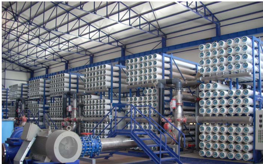
90000 CMD Municipal RO Plant (2008): Courtesy, MPE

Over 30 Billion cubic meters of purified water has been produced per year by the Membrane Systems using Wave Cyber membrane pressure vessels around the World.